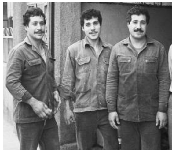
Figure 2: Car mechanics

From the cultural resources domain (top left of Figure 1), I brought the threads of a sufficient interest in cars to ask him in an informed manner about his. However, the biggest resource was from the personal trajectory domain (top right). Perhaps feeding my unnecessary preoccupation with class, I had experience of working as a hospital porter when a student in my late teens that brought me into contact with people from very different backgrounds to my own, whom I certainly at the time labelled as 'working class'. I also had experience of taking my car to mechanics in Iran, Syria and Egypt in my 20s and 30s. The three brothers in Figure 2 looked after my car in Damascus for five years from 1980 to 1985. My Arabic was limited; but we had a shared language around the physical environment of the parts and mechanics of the car. The setting enabled this because the established mechanic-customer small culture of